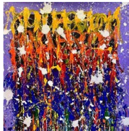
Can't Get Enough Acrylic and ink on canvas, 124 x 122 cm, 2022