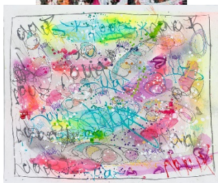
Flow Ink, oil crayon and pastel on paper mounted on wood, 83 x 98,4 cm, 2019