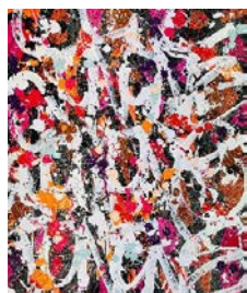
Blue Sky's Red Horizon, Acrylic and ink on canvas, 84 x 69 cm, 2022