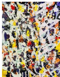
No Stoppin Acrylic and ink on canvas, 93 x 70 cm, 2022