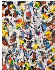
Projects Acrylic and ink on canvas, 86 x 65 cm, 2022