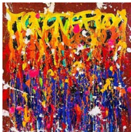
Here I Am Acrylic and ink on canvas, 123 x 123 cm, 2022