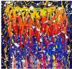
Double Tap Acrylic and ink on canvas, 120 x 124 cm, 2022