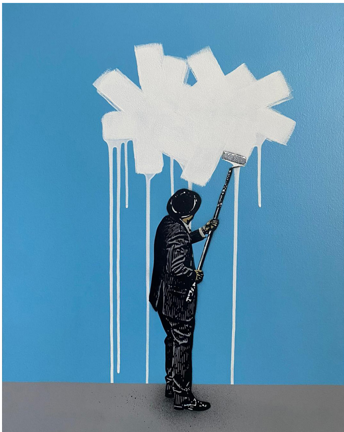
Nick Walker Untitled, 2023 Unique work